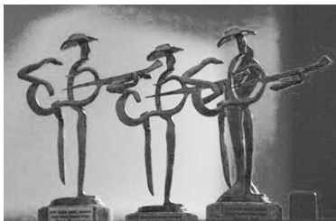
30TH ANNUAL BLUES MUSIC AWARDS MAY 7, 2009