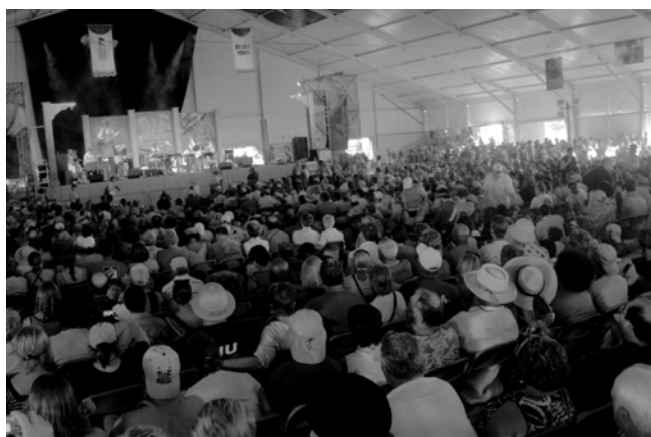
The massive Blues Tent

niversary New Orleans Jazz & Heritage Festival took place over 2 long weekends, Friday April 24 thru Sunday April 26, then Thursday April 30 thru Sunday May 3 rd . This festival had 12 venues and hundreds of vendors spread over an area that contained a 1 mile horse race track, the grandstands and surrounding area. This Fest is a MONSTER. Two of the stages are capable of holding 100,000 + people, at the same time. By my rough count there were 506 acts over the 7 day period. From Jazz to Blues to Zydeco to Pop to World to Rap