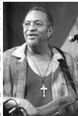
George Porter, Jr.

Ricky Fataar was a Beach Boy and plays with Bonnie Raitt.