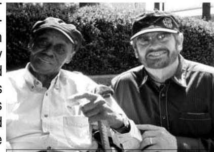
Pinetop Perkins and Bo Diddley

our way to the far end to catch the last act before the main event, the young and talented Homemade Jamz Band. The 2 brothers and sister were joined by their dad on harmonica for a smokin' set that had everyone moving to grooves. Eldest brother (7 years old!) laid into his double-neck guitar with dual for the body. When he jumped into the crowd the pipes belled out smoke as if still attached to a car.