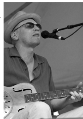
St. Louis Slim

A good number of performing artists had been nominated for Blues Music Awards, with several of them going on to win in their category on the following week-end in Memphis. These folks know how to run a musical city.