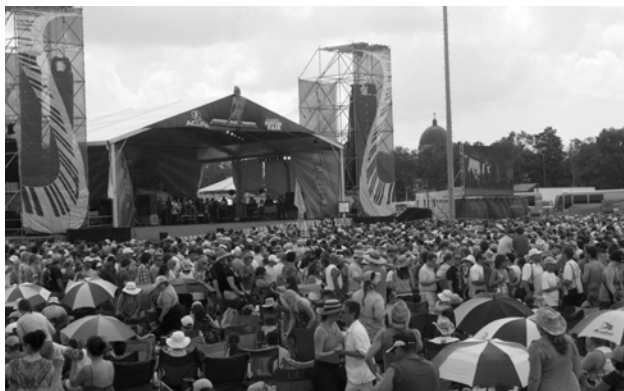
Neil Young on the Main Stage

I thought attending Jazz Fest in New Orleans would be fun. After all, I have been to the Chicago Blues Festival, the Waterfront Blues Festival numerous times, and The Legendary Rhythm and Blues Cruise 5 times. I have been to countless festivals large and small over the years. I thought I was ready for the "big one." But I had a thing or two to learn.