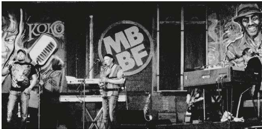
The Nevilles at MBBF

P.S. Don't forget to join the Sacramento Blues lovers Meet-up Group. These people are true blues lovers and they support SBS and the blues events around the area.