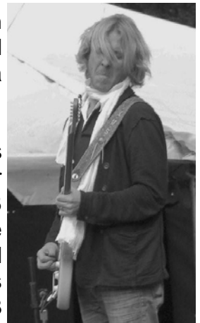
Kenny Wayne Shepherd